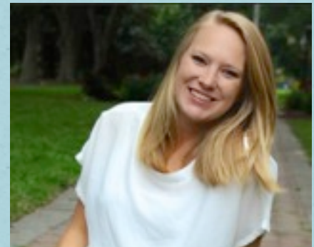
LD For Queen, page 5