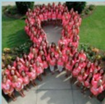
Tackle The Cure, page 3