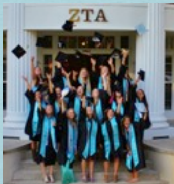
Goodbye to Our Seniors, page 4